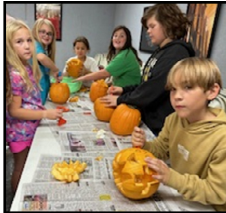
The youth’s activities in October included carving pumpkins, making jump ropes and filling Operation Christmas Child shoe boxes.