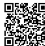
Our OCC QR Code