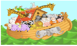
NOAH'S ARK PRESCHOOL (NAP)