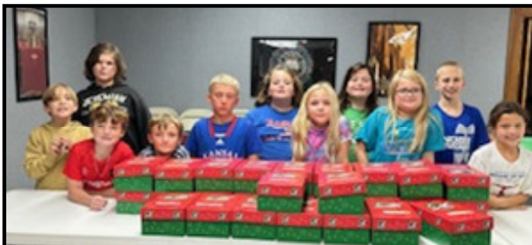
The youth in EYG put together 30 boxes

And don't forget we have the option of packing a box